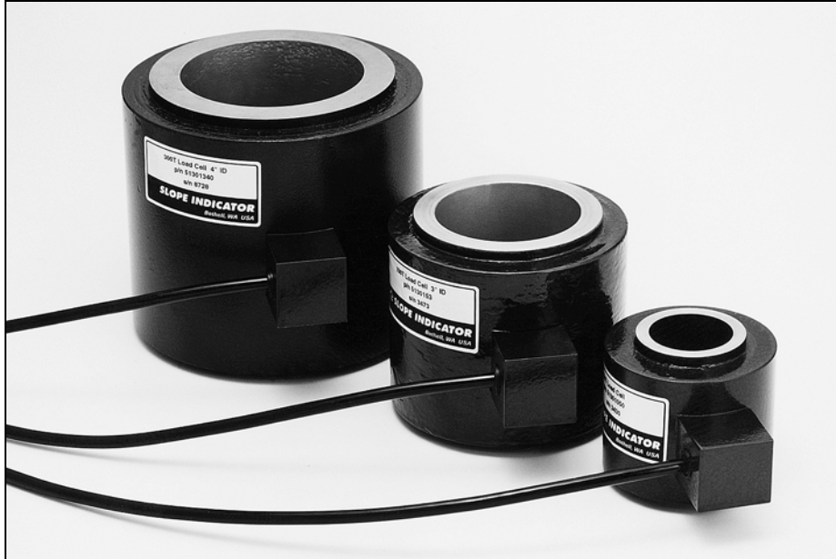
Center-Hole Load Cells